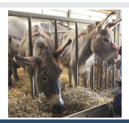
Figure 1: Donkey farming in European countries.

The jenny milk exceptionally having high nutritional benefits amongst other farming animals milk. Production of